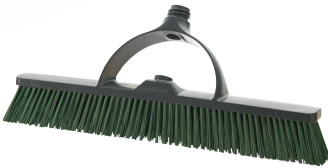
DURALOC™ OUTDOOR SWEEP