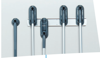
Unique snap-in storage system