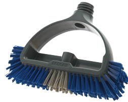
DURALOC™ DECK BRUSH

#61705-01-00 Blue #61705-02-00 Yellow #61705-03-00 Red #61705-05-00 Green #61705-07-00 Black