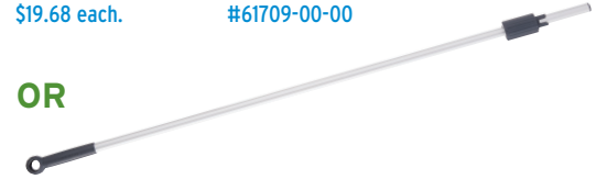
DURALOC™ 54" STRAIGHT HANDLE, LIGHTWEIGHT