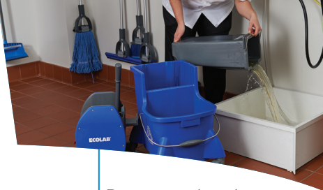
Rear compartment lifts out for easy emptying.