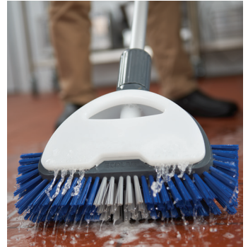
Extra-stiff center bristles make it easier to scrub stains out of grout