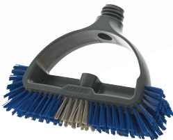
DURALOC™ DECK BRUSH