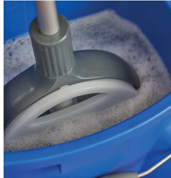
Solution dispenser ensures the correct amount of solution is applied