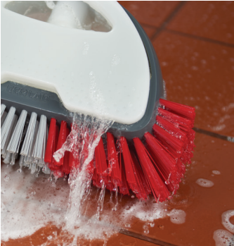
Strong polyester bristles scrub out tough spots