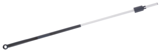
DURALOC™ 54" STRAIGHT HANDLE, OVERMOLD