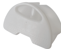
DURALOC™ BIG DIPPER™

#61703-01-00 Blue #61703-02-00 Yellow #61703-03-00 Red #61703-05-00 Green #61703-07-00 Black