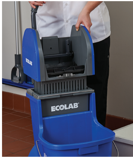
Mop wringer is completely removable