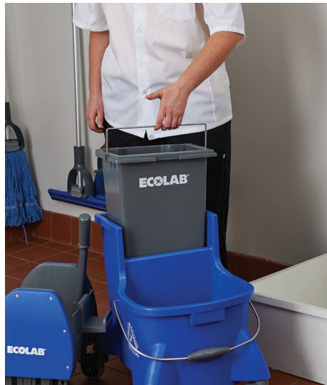
Rear compartment lifts out for easy emptying