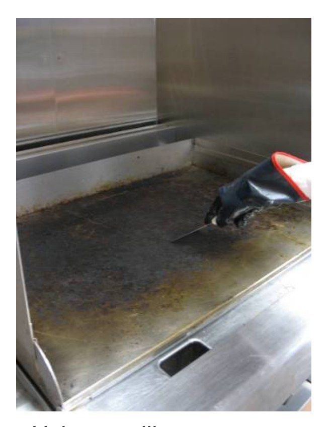
Using a grill scraper, remove burnt-on soils