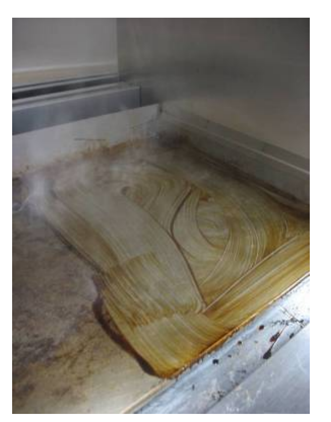
Spread to a thin coating over entire surface and let sit for one minute