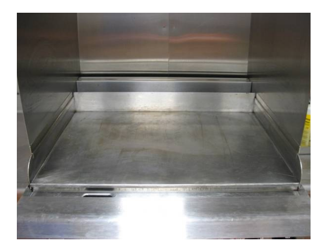
CAUTION: Grill will be HOT