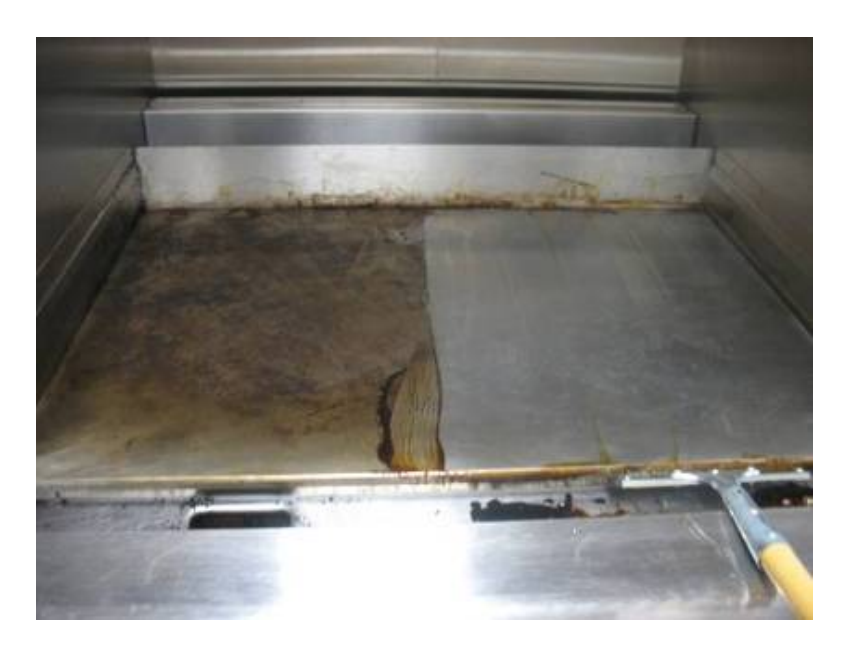
Squeegee product soils into the grease tray