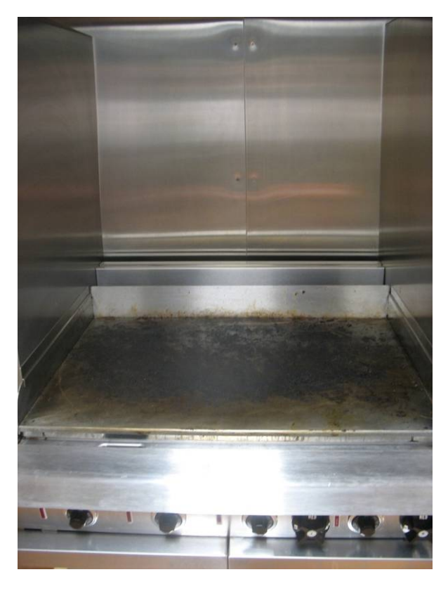
Turn off grill that is heated to 325°F - 475°F