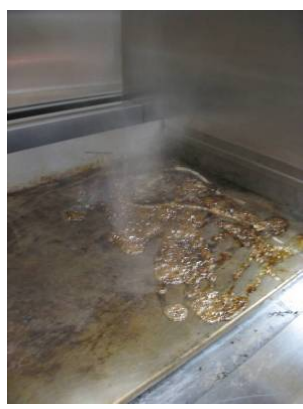
Apply 3-4 oz. of solution