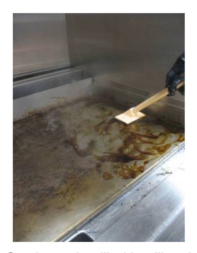
Gently scrub grill with grill pad